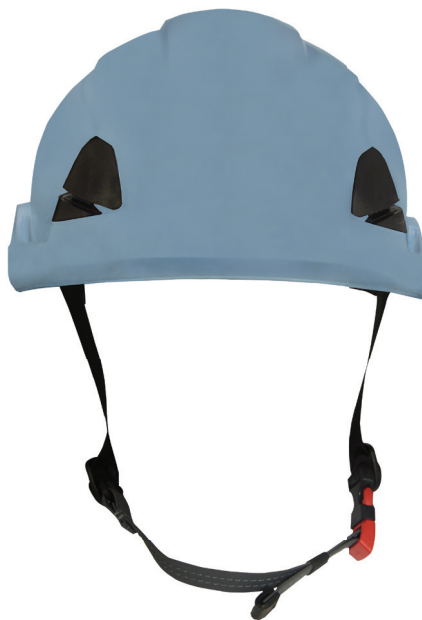
(Front with Chin Strap)