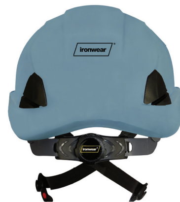
(Back with Ratchet)